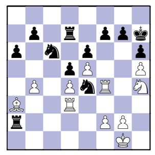
41.f3?! බg3 42.፰g4 ᡚxh5 43.b5 axb5 44.ඛc5 g5 45.f4 ᡚxf4 46.፰e3 ᡚe7 47.ᡚf3 ᡚf5 48.፰b3 ჶg6

23... ②b5 would allow 24.h6, after which there might be some counterplay for White. 24. ②d2 ②b5 25. □h4 0-0 26. □g4 ④h7 27. ②e1 □fc8 28. □d3 ②e7 29. ②d2 □c2 30. ②b4 ②c6 31. ②d2 ②e7 32. ②b4 □sc7 33. ②h4 ②c3 34. ②d6 □d7 35. ②b4 □c7 36. ②d6 □d7 37. ②b4 ②e4 38. □f4 ②c6 39. ②a3 □a2 40.b4 a6