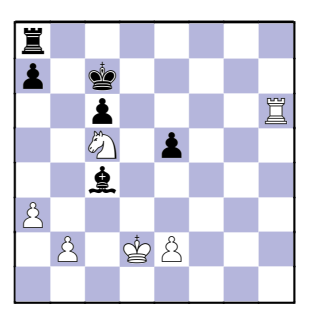
31...$a6 32.$\darkled{2}c3+ \dot{\phi}d6 33.$\dot{\phi}h6+ \dot{\phi}d7 34.\(\dagge\)d2 \(\dagge\)c4 35.\(\dagge\)e4 \(\dagge\)c7 36.\(\dagge\)xc5

36... \(\delta g8?!\) Errors come out of difficulties. Note my previous comment on move 31.